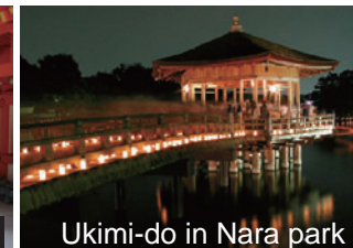
Ukimi-do in Nara park